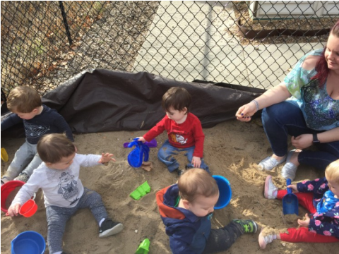
Warmer days means more outdoor activities!

Happy March! February went by so quickly. Thank you all for a wonderful Valentine's Day party! The kiddos love when they get to hang out with their parents at school (especially when special snacks are involved!)